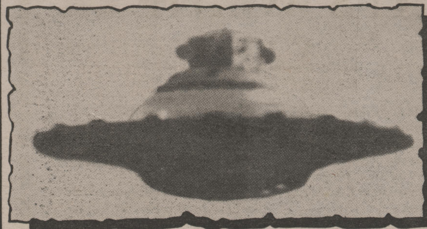
SHAPE OF THINGS TO COME? . . . how some imagine a UFO