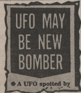
From the Daily Star December 2, 1988

● October 27, 1988. Hundreds of people in Kent called police after a glowing object lit up the sky.