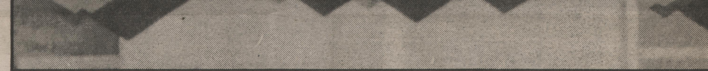
FUTURISTIC SHAPE... a stunning aerial view of the new US super sleuth Stealth Bomber

science-fiction dream transformed into awesome reality.